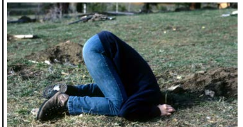
Remember to Check Your Soil Moisture