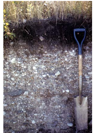
If Your Soil Looks Like This - It Has A Low Water-Holding Capacity

Soil near 100% of its water holding forms a ball when squeezed and leaves the hand moist. Water is visible on the surface of the soil and the hand as a shiny surface. Bouncing the soil in the hand usually brings water to the surface. Soil near 75% of its water holding capacity also forms a ball and leaves the hand moist but no actual water is visible on the hand or soil when bounced.